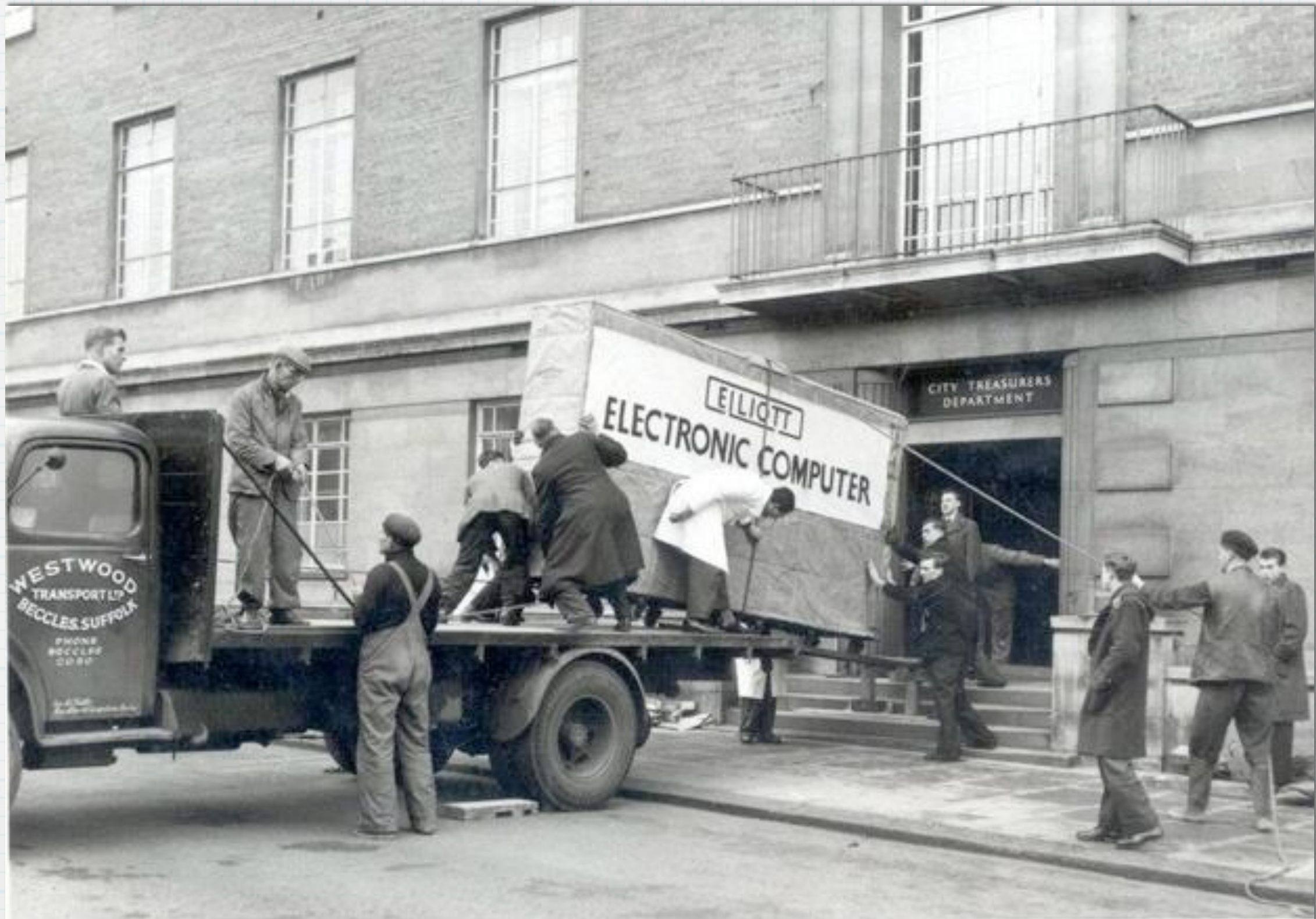
Norwich Council City Treasurer's Department receiving its first computer in 1957